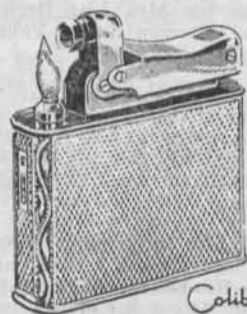
Calibri POCKET LIGHTER