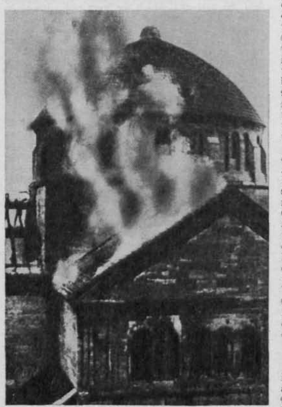
Fasanenstrasse Synagogue in flames

The rescue work was facilitated by the introduction of two new schemes concerning which the present writer could obtain some first-hand experi-