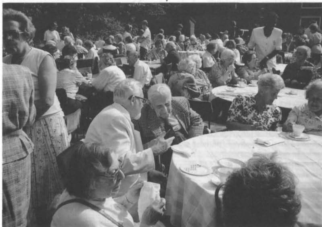
Just a few of the guests enjoying the sunshine at the 'Open Day'.

H einrich Stahl House Open Day in early September attracted large numbers and was a great success.