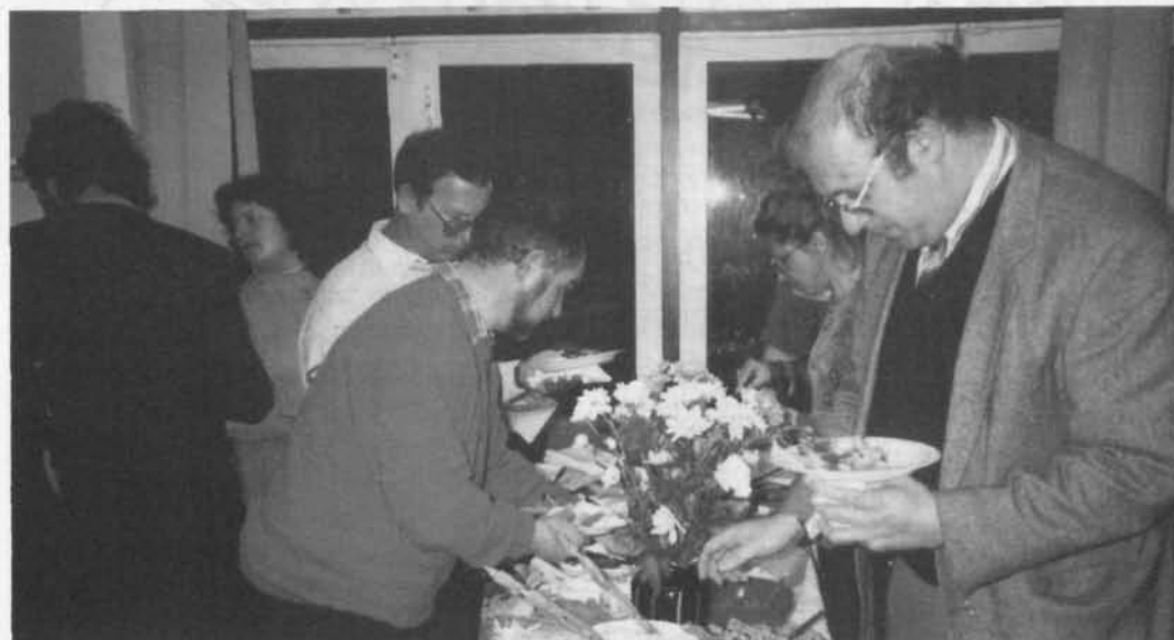
Getting down to serious business at the AGM