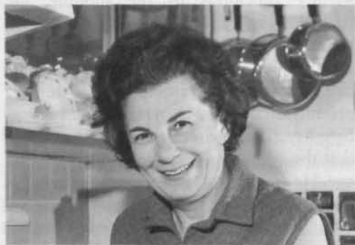
Curd Cheese Pudding

This is a marvellous pudding for chilly winter evenings. The quantities should feed 4-6, but I have known far fewer people polish it off with the greatest ease as it is very light. Use curd rather than cottage cheese, with a fat content of approximately 20%.