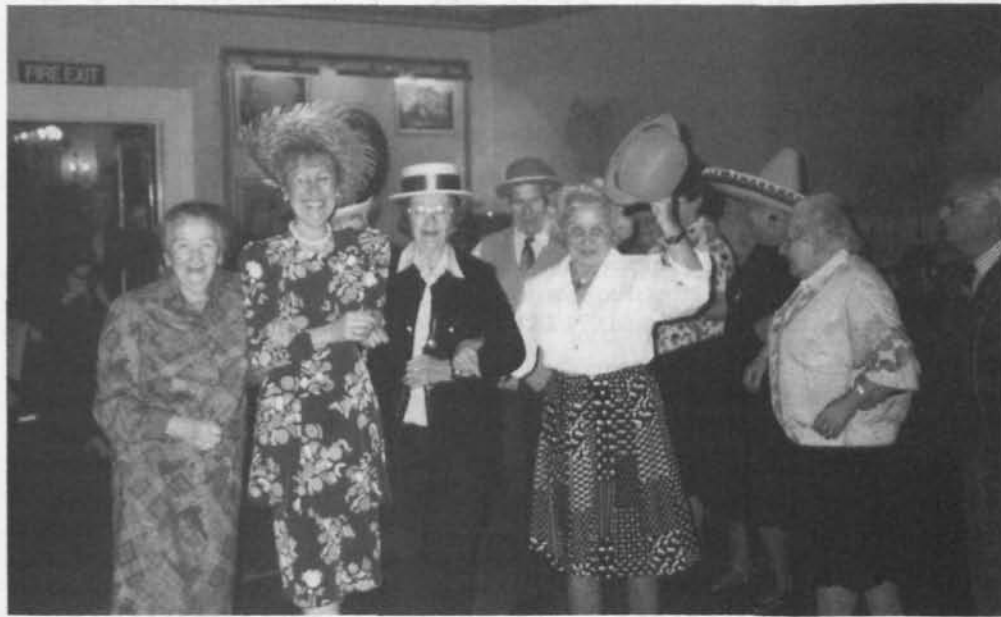
Tripping the Light Fantastic in Bournemouth