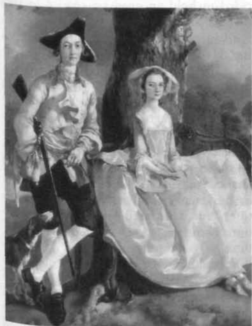
Mr and Mrs Andrews by Thomas Gainsborough, at the National Gallery .

At the Royal Academy's Sackler Gallery until the 23 January From Mantegna to Picasso . Drawings from the Thaw Collection at the Pierpont Morgan Library, New York. The exhibition includes important examples by Rubens, Rembrandt, Claude Lorraine, Delacroix, Cézanne, Degas and Gauguin. Also at the Royal Academy (23 January to 6 April) in the main galleries, Braque: The Late Works . This gathering of some fifty paintings will include all of the great cycles of paintings from his mature years – The Interiors , Billiard Tables , Studios and Birds .