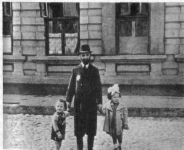
Inmates of the Lodz ghetto, 1941

So much for the philosophical objections to teaching the Holocaust. To the 'pragmatist' objectors our answer must be that if children can be exposed to the horrors of the Somme and Hiroshima without becoming traumatised, they should not remain ignorant of Auschwitz. The Holocaust, after all, carries a more wide-ranging warning to a world still mired in racial conflict and fanaticism than any other calamity in human history. (And as for the danger of Jewish pupils perceiving their past only in terms of lachrymose martyrology, successive generations of Israeli schoolchildren have not taken noticeable harm) □