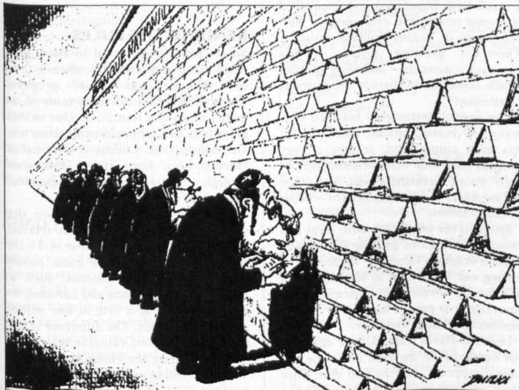
From the French language Geneva daily 24 Heures, January 8, 1997.

Application forms may be obtained from: Claims Conference Article 2 Fund, Sophienstrasse 26, 60487 Frankfurt am Main, Germany