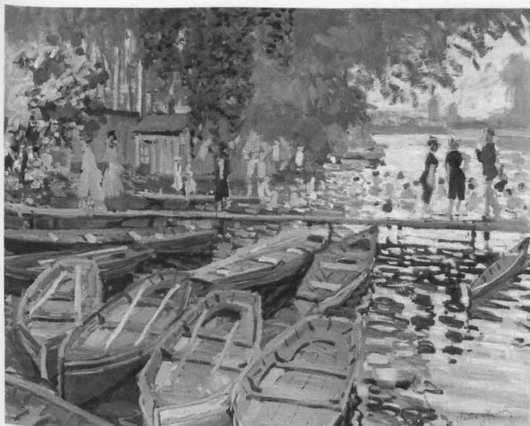
Bathers at La Grenouilliere, Claude-Oscar Monet.