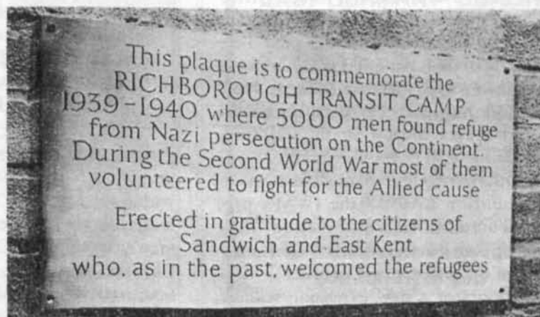
Plaque commemorating the accommodation of Jewish refugees at Richborough, Kent, in the years prior to World War II, for which members of the AJR subscribed in 1971.

One's blood runs cold on seeing a Jew-hunter comparing himself to a victim of Judeophobia. Despite the nauseating comparison Papon's statement does, however, provide some welcome reassurance. It is evidence of the fact that in contemporary French usage the name Captain Dreyfus conjures up an image – not of treason, as his detractors intended – but of scapegoating and victimhood □