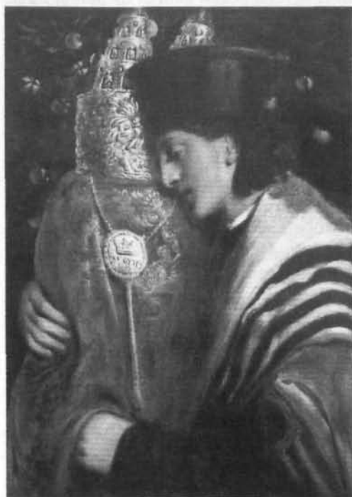
Scrolls of the Law, Simeon Solomon, 1840-1905. Art Treasures of England, Royal Academy till April 13th.