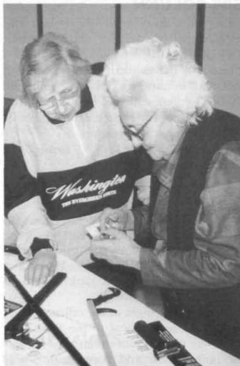
Members assess various aids to mobility and independence at the Day Centre.