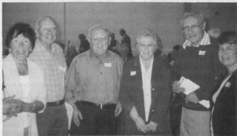
Taking time out at Manchester Northern Groups gathering