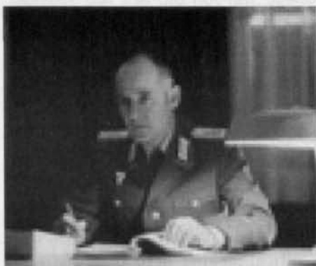
Ulrich Mühe (Hauptmann Wiesler), 20.6.1953-22.7.2007

The sonata's title has echoes of Bertolt Brecht's play Der gute Mensch von Sezuan ( The Good Person of Sezuan ), which deals with the impossibility of being good in an evil world. The film quotes from Brecht when Wiesler reads, in Dreyman's copy of Brecht's poetry, the poem Erinnerung an die Marie A. ( Memory of Marie A. ), with its