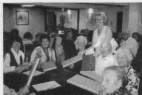
Northern holiday in St Annes: the winning quiz team