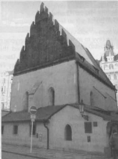
Old-New Synagogue, Prague