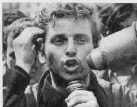
Daniel Cohn-Bendit, leader of the student protesters during the May 1968 riots in France

Refugees were particularly shocked when student radicals disrupted events connected to the Holocaust. In May 1968, the Journal reported that a joint meeting of Christians and Jews taking place in West Berlin's Opera House as part of Brotherhood Week, an annual event held across West Germany to promote reconciliation and tolerance, had been the object of a left-wing demonstration against neo-Nazism, the rise of the far-right NPD and the 'hypocrisy' of Brotherhood Week itself. As the AJR supported Brotherhood Week, and as refugees like the