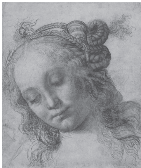
Andrea del Verrocchio's Head of a Woman , 1475