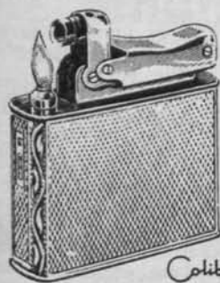
Calibri POCKET LIGHTER