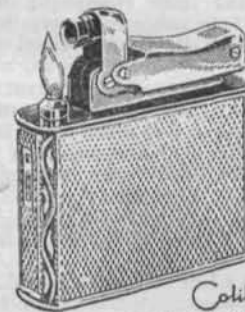
Calibri POCKET LIGHTER