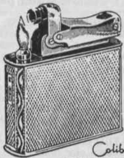
Calibri POCKET LIGHTER

Under the auspices of the Anglo-German Association Mr. Ernst Lemmer (Berlin), MdB, will give a public lecture on "The Future of Berlin," on Thursday, November 1, 6.30 p.m., at Caxton Hall, S.W.1.