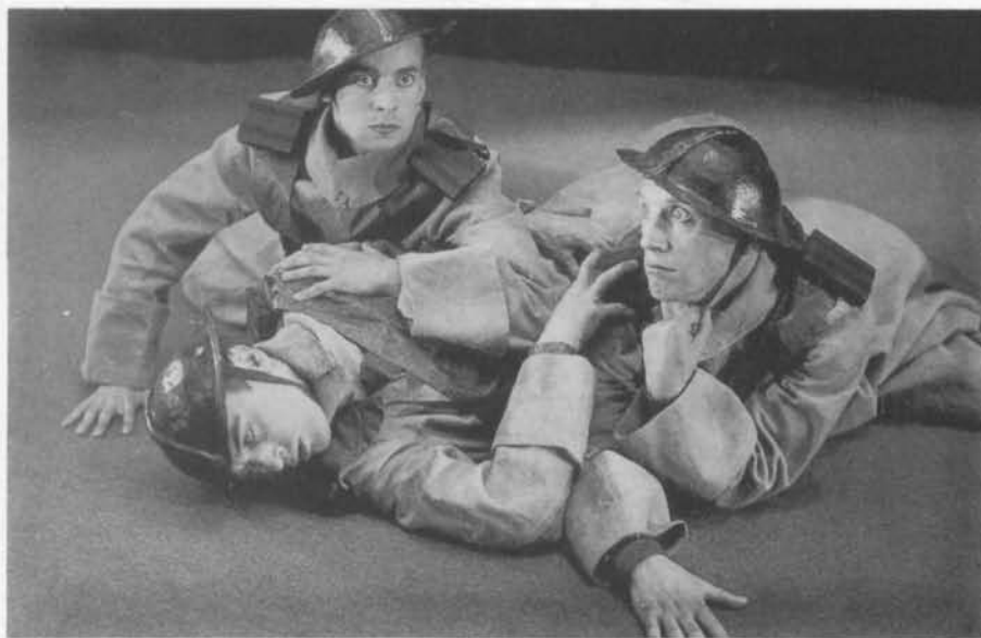
‘Stage and concert platforms were less readily conquered’. Ballets Jooss ‘The mirror’, 1935

National politics, it might be thought, would be completely closed to those of foreign descent but ever since Lionel Nathan Rothschild entered the House of Commons, Britain has admitted enough contributions to political theory and practice from German-Jewish immigrants to demonstrate a ‘degree of openness to outsiders... unparalleled in the European context’. Rather less ready to accept their Continental colleagues were members of the medical profession. Requalification requirements (and, for a time, internment) were serious obstacles for the newcomers. Notwithstanding the Nobel Prizes of Ernst