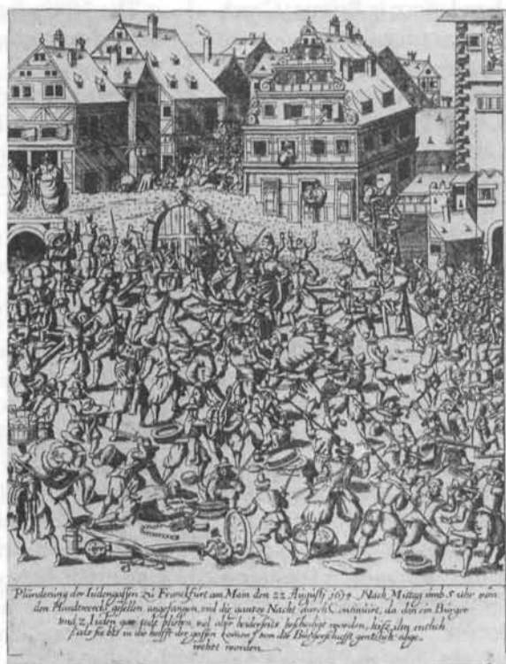
The pillaging of the Ghetto – 1614.

In the person of Levi the post-1492 Sephardi tradition intersects with the post-1933 Ashkenazi one. That Levi could write after Auschwitz testifies to the enduring strength of Sephardi Jewish civilisation. We have much to be proud of!