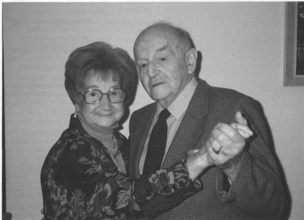
Out together dancing cheek to cheek.