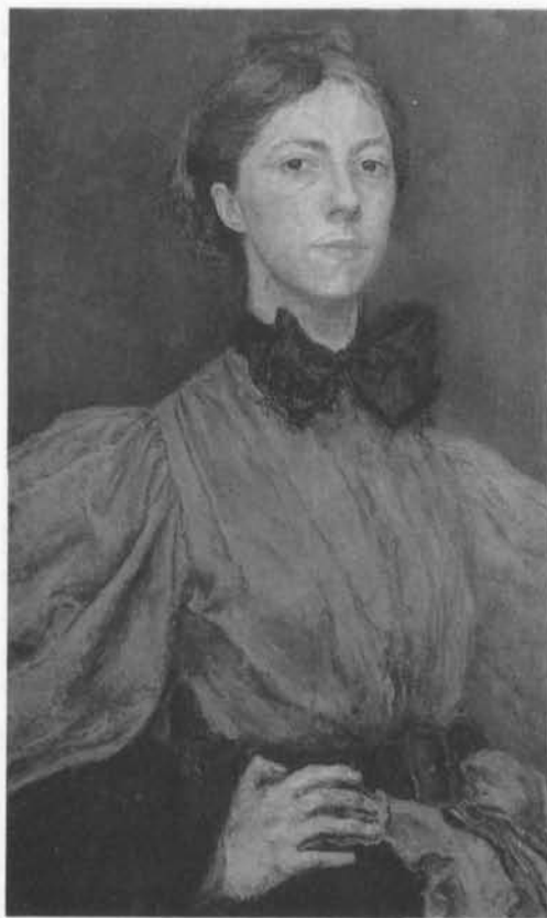
Self-Portrait by Gwen John c. 1900.

Leonora Carrington , an ex-debutante, was just 19 years old in 1937 when she met