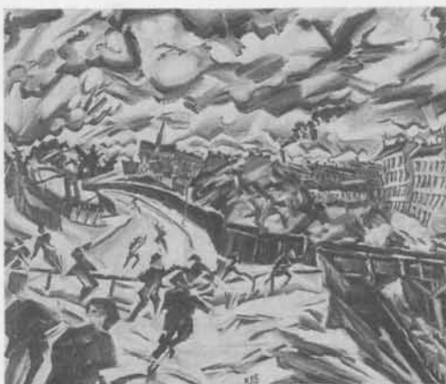
Ludwig Meidner, Apocalyptic Landscape , 1913.