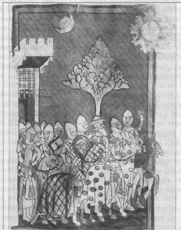
Joshua riding into battle, Rudolph von Ems, 1250.

Other, even more worrying, questions arise. Interwar Austria experienced dire poverty - a fact often adduced in extenuation of its pro-Nazi sentiment. Postwar Austria has, however, been riding a consistently rising tide of prosperity - so what objective