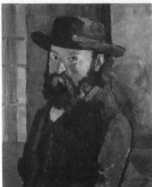
Cézanne, Portrait by the artist , 1879-82

The National Gallery is showing (until 19 May) Masterpieces from the Doria Pamphilj Gallery, Rome , one of the finest private collections of old master paintings in the world. Included are works by Velasquez, Caravaggio, Raphael, Titian and many others. An illustrated book with reproductions of the most important pictures in the collection is available at the exhibition (price £7.95).