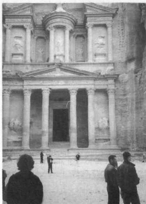
Petra, Jordan's 'rose-red city as old as time'.

The Nabatean city of Petra owed its prosperity to its position on the spice route from India. It resisted Roman invasion until they cut off its water supply. An earthquake then finished what the Romans had started. What remains today is a Roman road and some amazing rock carvings. The most spectacular is known