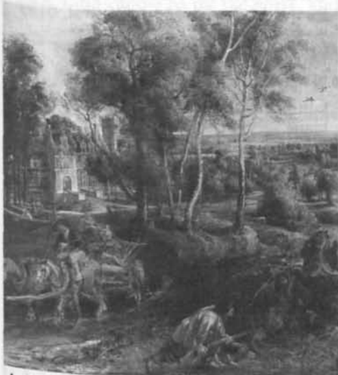
Autumn landscape with a view of Het Steen in the early morning, Peter Paul Rubens, probably 1636.

The Royal Academy will be showing a retrospective exhibition of Giacometti – the most comprehensive survey of his