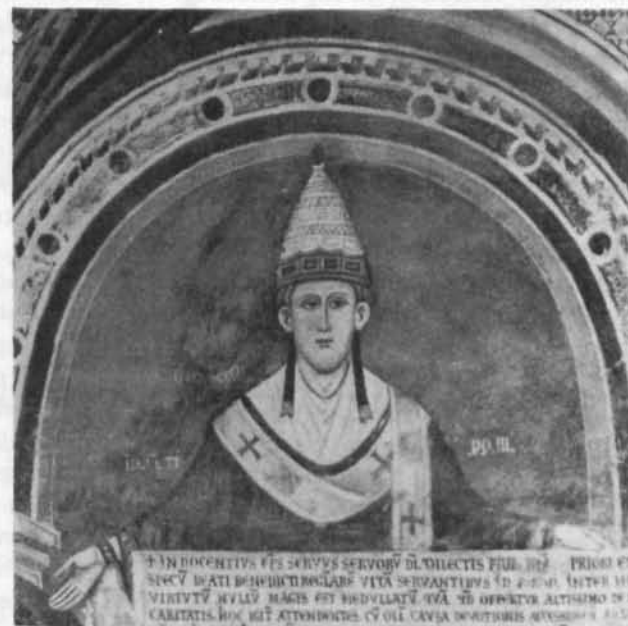
Pope Innocent III (1198-1216) who forced Jews to wear distinctive dress and engage in money-lending.

Could as crucial a point of Catholic dogma as the Apostolic Succession – ie the notion that each occupant of St Peter's throne hands spiritual grace on to the next – withstand critical scrutiny of, say, the conduct of Pius XII? □