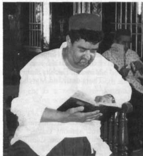
The Rabbi maintains the ancient Torah reading tradition.

each Pesach. This building dates from the 1920s and has opposite its hostel for the 'Pesach pilgrims'. The plain white concrete exterior is in sharp contrast to the ornate heavy wooden doors leading to a unique interior with Moorish arches and columns, geometrically decorated tiling and an intricate ceiling. A team of rabbi, chazan and elderly congregants conduct a non-stop vigil reading from the Torah - a tradition here dating back literally thousands of years.