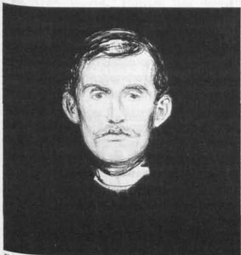
Edvard Munch, self portrait, 1863-1944, British Museum.

The Marlborough Gallery is showing Frank Auerbach, new paintings and drawings till 15 February. Marlborough Graphics will also stage a retrospective of all Auerbach's etchings from 1954.