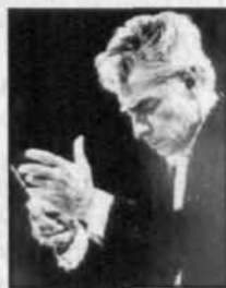
Herbert von Karajan

reputable historians to write authoritative histories of their enterprise. Scholars ready to undertake this chore were entering a minefield; even Professor Hans Mommsen had doubts cast on his professional integrity when he published a history of Volkswagen.