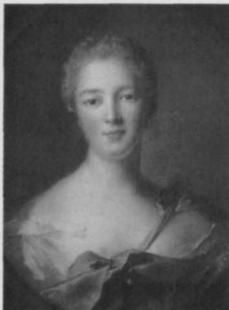
Madame de Pompadour by Jean-Marc Nattier

Mme de Pompadour is one of those figures whose name is as familiar as bread and butter, but whose role remains a mystery. The National Gallery is debunking the myths with an exhibition of her portraits or others that she inspired in her role as politician, artistic chatelaine and mistress of Louis XV. Madame de Pompadour: Images of a Mistress depicts one of the most powerful women of the eighteenth century. Blamed for her role in France's Seven Years War, she came to personify the Age of Enlightenment as a protégée of Voltaire with modern views on religion. Although her artistic tastes were not innovative, she spent more money on the arts than anyone of her time - certainly more than her successor, Mme Du Barry. But she also commissioned some bad paintings by Carle Vanloo of children in the guise of artists and musicians. She even won the Queen's favour by urging the King to buy her presents.