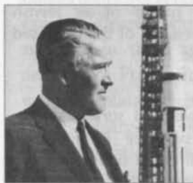
Werner von Braun