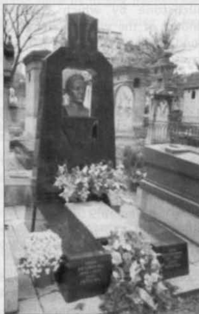
Petliura's grave in Montparnasse Cemetery, Paris

In the witches' cauldron that was Ukraine in the revolutionary period, three separate conflicts were fought out simultaneously: