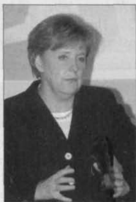
German Chancellor Angela Merkel

The post-war West German constitution was designed to promote effective coalition governments, given that electoral systems based on proportional representation routinely produce governments consisting of more than one party. This was the result of the bitter lessons learnt under the Weimar Republic (1918-33), when repeated breakdowns of weak coalition governments contributed decisively to the collapse of the parliamentary system and to Hitler's rise to power.