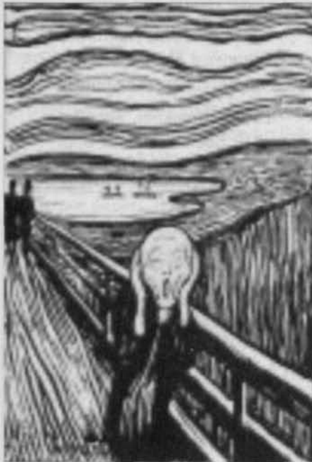
Edvard Munch, The Scream (1893)

The primal Scream of the Norwegian artist Edvard Munch (1863-1944) has been described as the world's most copied painting. The very sight of it evokes mankind's visceral fear of both the known and the unknown. Stolen from art galleries, emblazoned on T-shirts, merchandised to the point of cliché, The Scream comes in several versions, like symbolic fliers for Munch's self-portraits which largely convey his loneliness and depression. But if you are looking for The Scream at the Royal Academy's exhibition, Edvard Munch by Himself , you won't find it. What you will find is an odyssey of suffering and self-discovery so intense as to arouse in the viewer a deep and unexpected compassion.