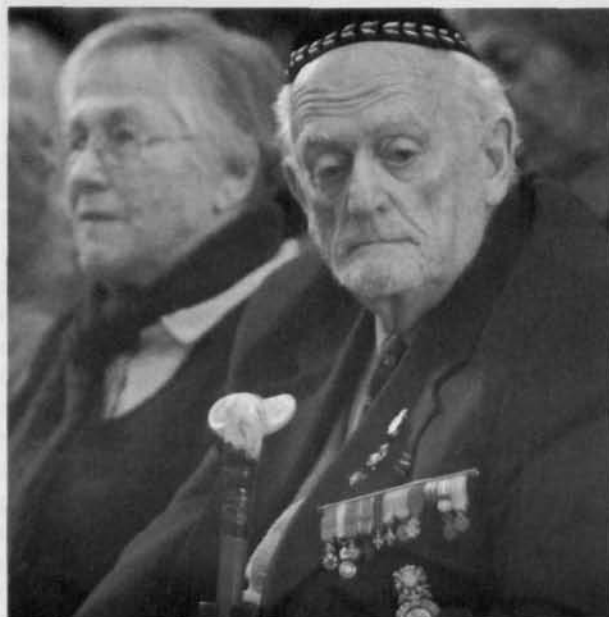
AJR Holocaust Memorial Day service at Belsize Square Synagogue, London (see story on page 16)