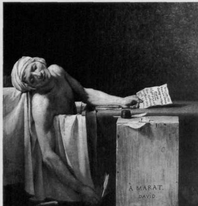
Jacques-Louis David, The Death of Marat 1793 . Oil on canvas. Musées Royaux des Beaux-Arts, Brussels

The political turbulence of eighteenth-century Europe, with the overthrow of the French monarchy and its eventual reinstatement after the fall of Napoleon, is the backdrop to the Royal Academy's current exhibition, Citizens and Kings: Portraits in the Age of Revolution, 1760-1830 . As crowned heads rolled in France, Europe, Britain and America were caught in the turbulence of war, a clinically insane king, George III, was deposed, and the rising bourgeoisie challenged traditional