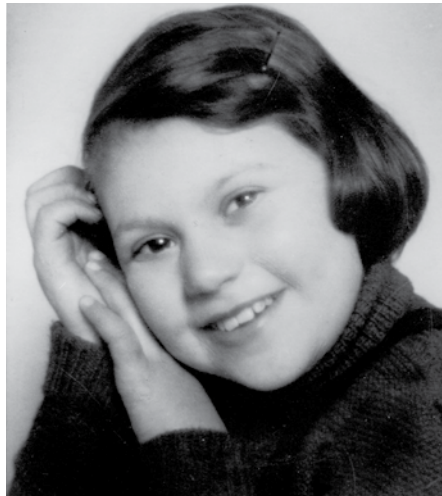
The author in 1939 . . .

My next visit to Vienna was in 1988 with my husband, who had been invited there by a pharmaceutical company for which he was a consultant. This was in luxury, staying at the Hilton and being wined and dined at top places – a completely new experience for me. As my husband's work was relevant