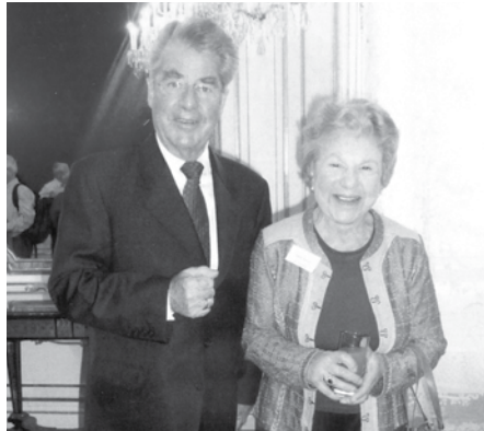
. . . and with President Heinz Fischer in 2010

to psychiatric illness we were taken to the Steinhof, a famous mental hospital I knew of as a child from the ditty 'Steinhof, Steinhof, die Toren auf, Die x kommt im Dauerlauf' (Steinhof, Steinhof, open your gates, x is coming fast). Now, I learned it was a humane, progressive institution where patients were treated kindly, encouraged to wander in beautiful surroundings and worship in a chapel designed by a famous architect, Otto Wagner.