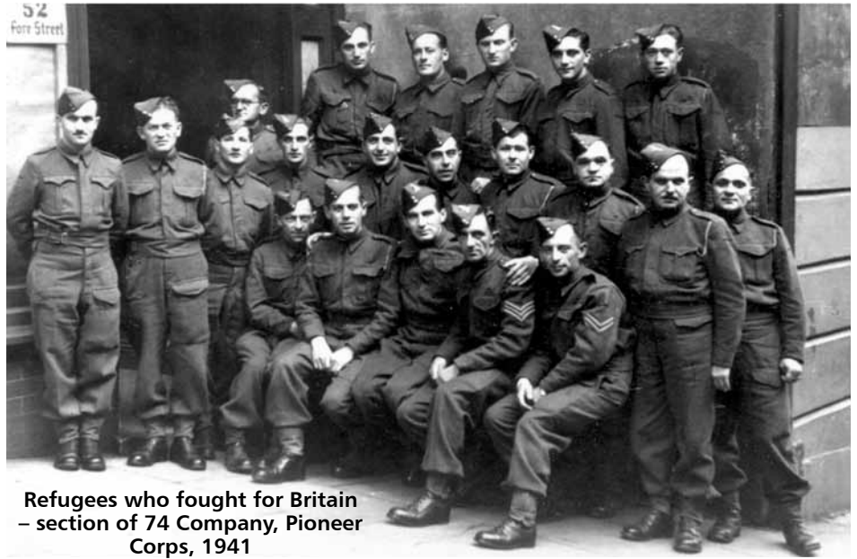
Refugees who fought for Britain – section of 74 Company, Pioneer Corps, 1941

Another as yet unacknowledged dimension of the refugees' contribution to the war effort is their return to Germany at the end of the war in British army uniform to begin the reconstruction of post-war Germany and Austria. Their fluency in German made their work indispensable to the Allies. This included vital work in the restoration of democracy, the