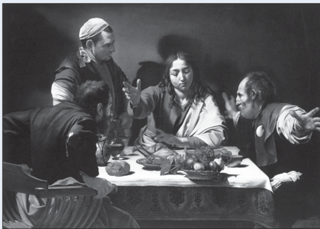
Michelangelo Merisi da Caravaggio The Supper at Emmaus 1601 (The National Gallery, London)

He was the first artist to paint someone eating an apple or being bitten by a lizard and it was this naturalism which brought Caravaggio right into our face. The expression of shock